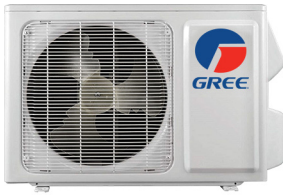
VITA condensing unit