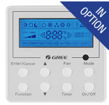
Wired controller (XE-71)