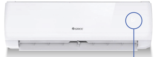
VITA wall-mounted unit